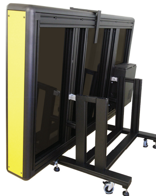
Folds to fit through standard doorway

Operating the VERSASCAN is as easy as using a photocopier. The scan can be engaged via the scan pad, foot pedal, mouse, or keyboard to accommodate all users. For flat originals, the V3D function can be easily disabled to scan in 2D. Additionally, the VERSASCAN has a fold-up & roll-away mounting system to easily move your scanner through doorways – regardless of its size. Like all SMA scanners, the VERSASCAN operates independent of ambient light and can be utilized in all lighting environments.